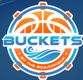
Photo & Video Release

By entering any Buckets facility, attendees consent to being photographed, filmed, and recorded.